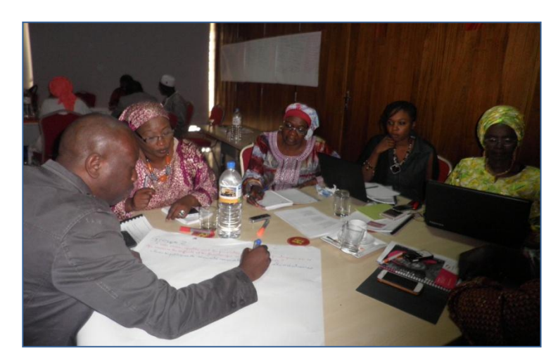
Fig. 6: Small group discussion, Dakar policy workshop

When the results of community members' rankings are disaggregated according to young people's views and those of middle and older generation adults, there was consensus about the importance of improving the targeting of conditional cash transfers and other social protection services and access to healthcare (both in the two groups' top three priorities). Middle and older generation adults thought that there should be more dedicated support within schools for bereaved young people (which they ranked as their third priority), while young people considered improving the assistance available to poor families as more important (their second priority).