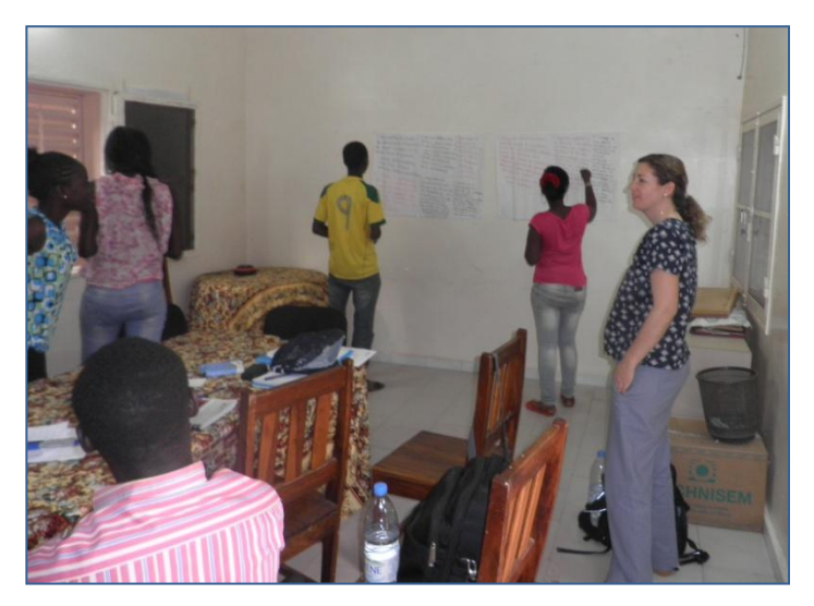
Fig 4: Ranking exercise, workshop with young people, Kaolack

The participatory dissemination workshops enabled us to present our preliminary findings and discuss further our suggestions for policy and practice with community members, policymakers and practitioners. We used a participatory ranking exercise to enable participants to vote (using stickers on flipchart paper) for the three most important priorities, from the nine suggestions we proposed (see Figure 4). Table 10.1 shows the importance of each suggestion for community members (based on workshops with young people and with middle-aged and older adults in each locality in Dakar and Kaolack) and for professionals, local and religious leaders in Dakar and Kaolack, as well as the combined overall priority.