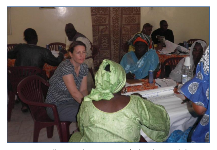
Fig.5: Small group discussion, Kaolack policy workshop