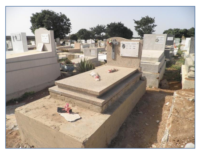
Fig. 2: Catholic cemetery Saint-Lazare de Béthanie, Dakar. No one was observed to be visiting graves on our day of visit (a weekday).

Muslim interviewees also spoke of wanting an inscription on the grave, although for many this involved a simple plaque or marker, and for several, there was nothing to mark the grave, although some spoke of wanting to do this. Some spoke of spending significant sums of money on the gravestone: 'When I got my pension, I bought five cases of tiles to build the grave. I spent 90,000 CFA [equivalent of £102] in total'(Cheikh, man, aged 77, Toucouleur, mother died a year previously, middling household). Lack of financial means was a significant limitation for several interviewees: 'They put a metal board on the grave with her name on it. I encircled the grave with rocks because I couldn't afford a gravestone' (Malang, widower, aged 47, wife died two years previously, poor household).